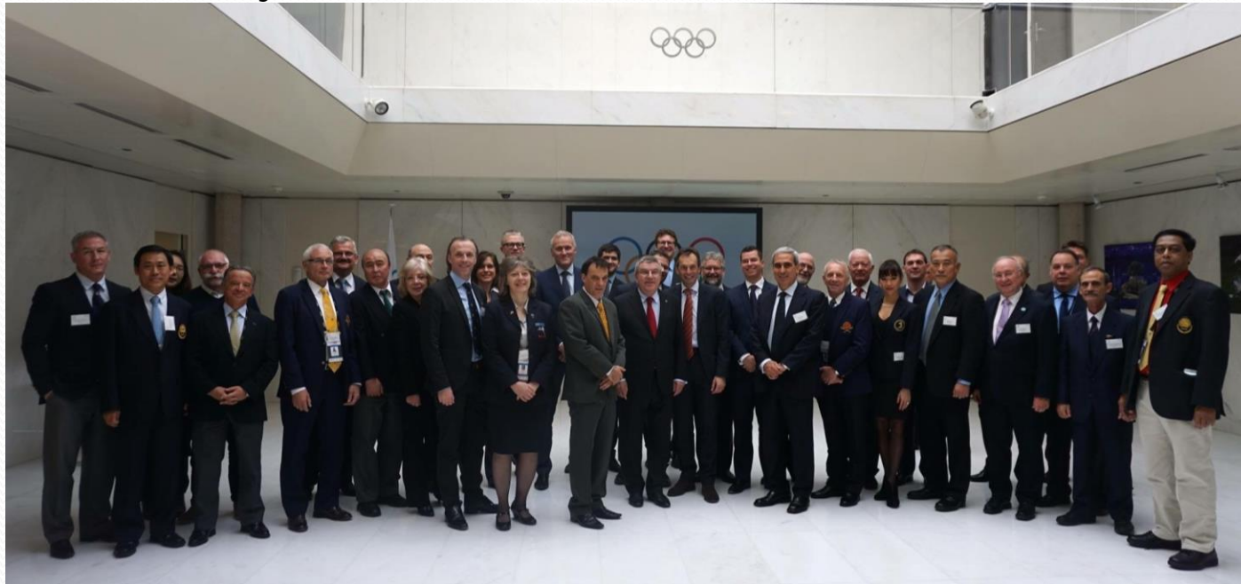
AIMS members meeting with the IOC President in the IOC headquarter in Lausanne, Switzerland